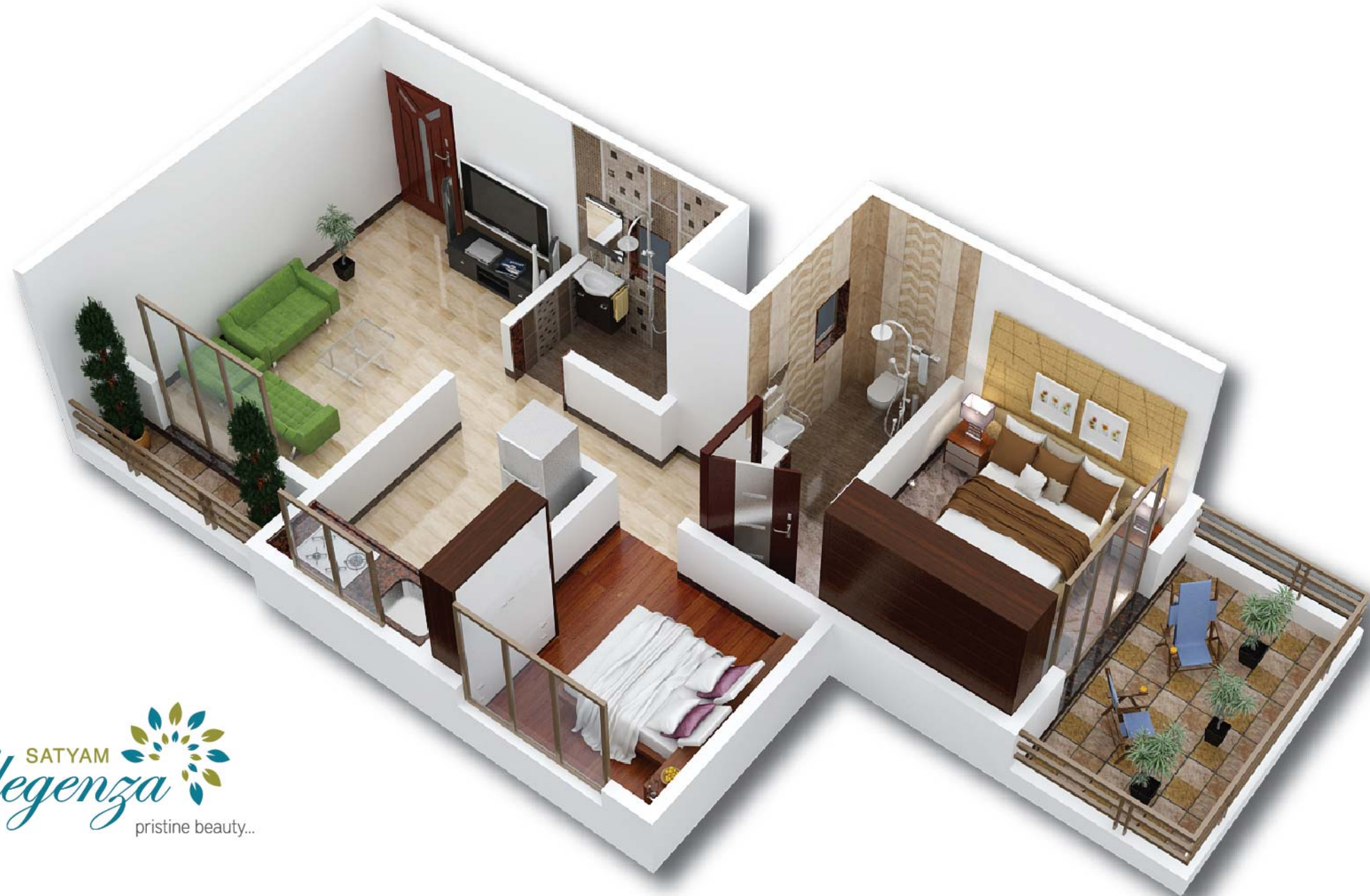
2BHK 3D View